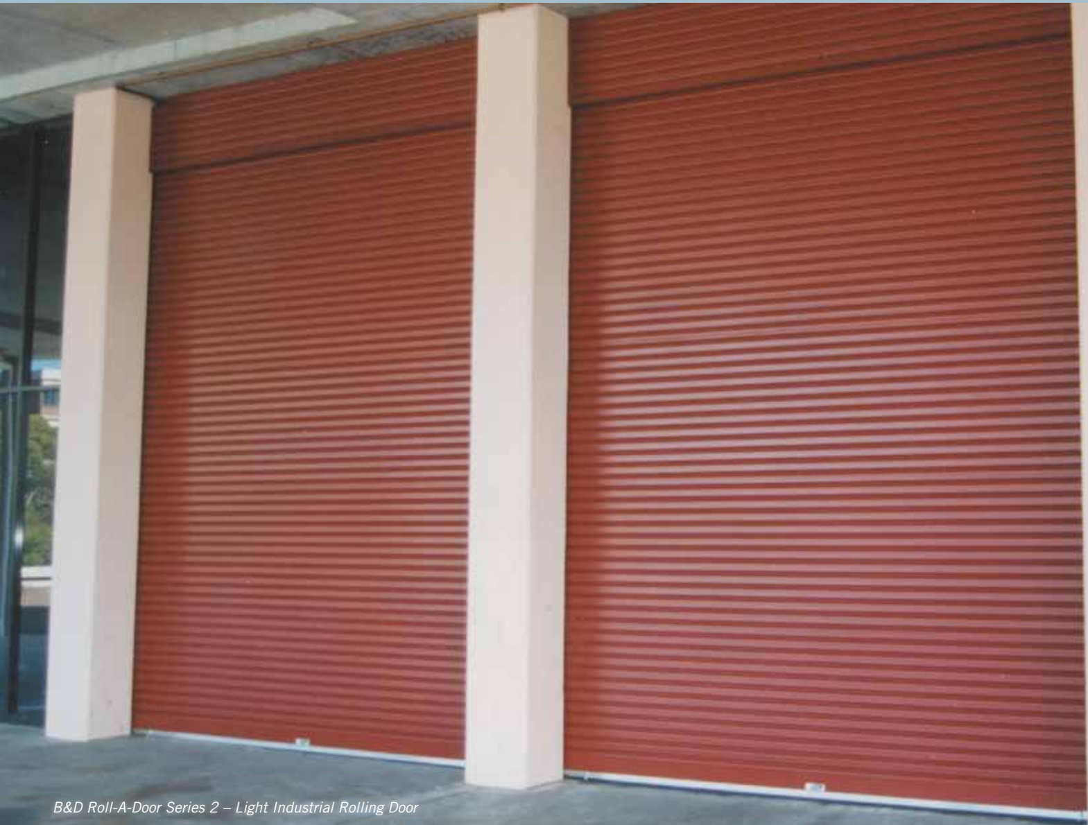
B&D Roll-A-Door Series 2 – Light Industrial Rolling Door