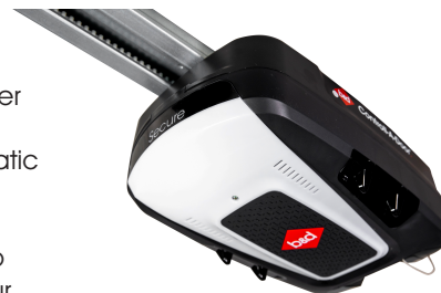
B&D Secure opener

It is important to partner your B&D® door with a genuine B&D® automatic opener. Designed to exacting standards in Australia and made to work in unison with your door year after year.